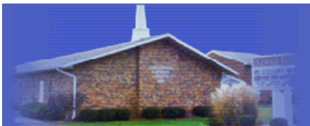
Edgewood Baptist Church

A Growing Church For A Growing Community